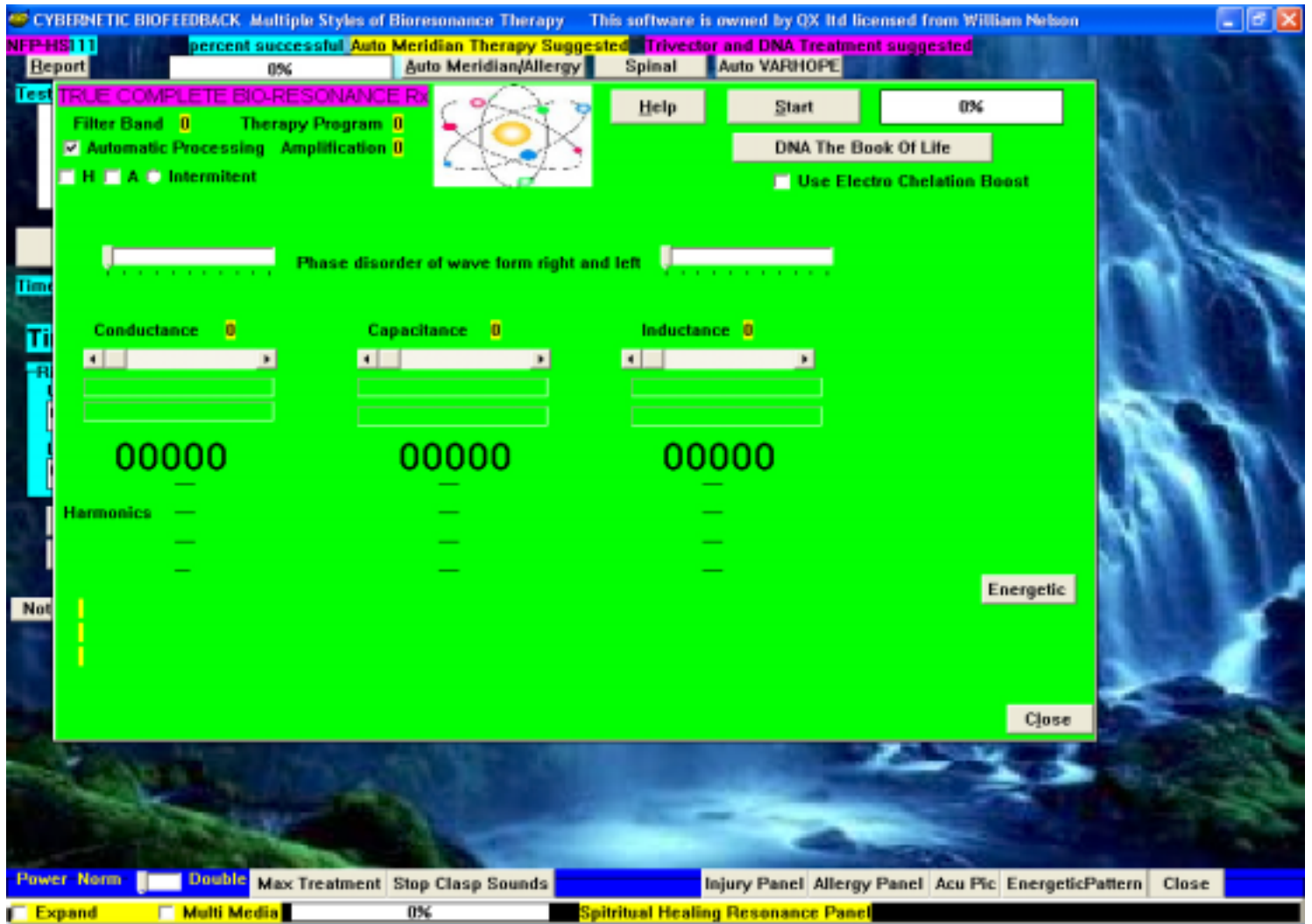
Figure 16 – Auto Trivector

This is a deep cellular balancing therapy extremely effective in recharging a clients "battery". It assists the body in retaining the frequencies from the entire session.